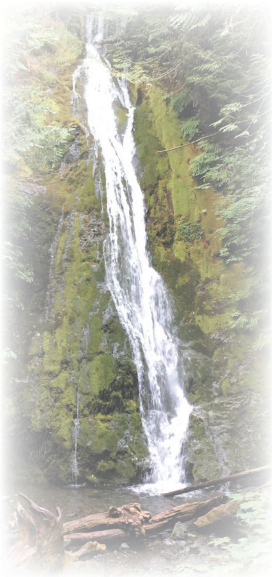
Madison Falls, 2019 Pastel on paper 12 x 9 inches