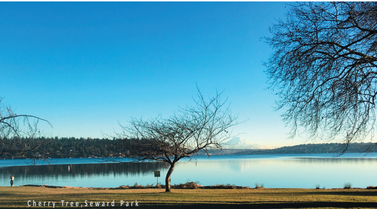
Cherry Tree, Seward Park