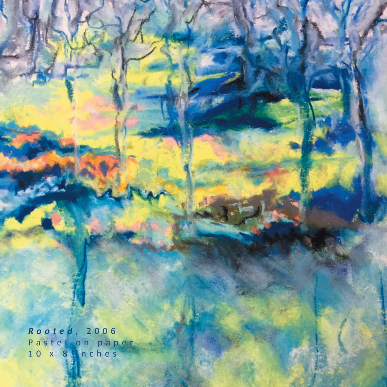
Rooted , 2006 Pastel on paper 10 x 8 inches